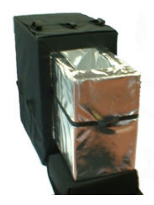
New prevention solution on board civilian aircrafts