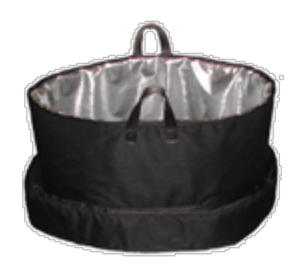
GBK (Ground Bomb Killer) ensures users' safety with ballistic belt that is placed over the suspicious object to protect the surrounding area until a specialized response team arrives.