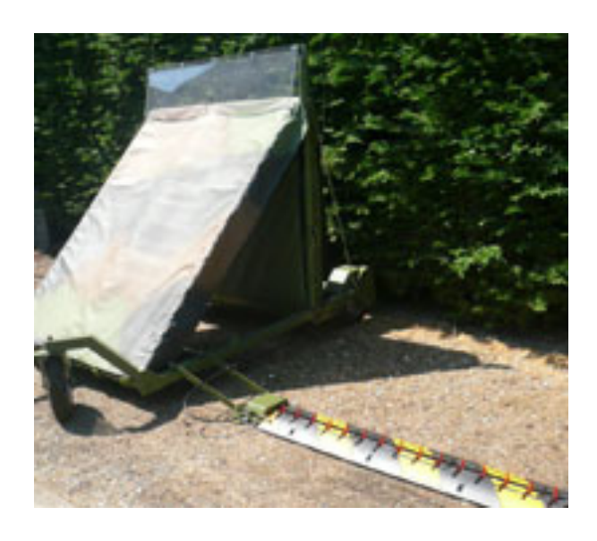
The N.A. WALL can be use on check points, in the entrance of a military compound or outside for building protection.