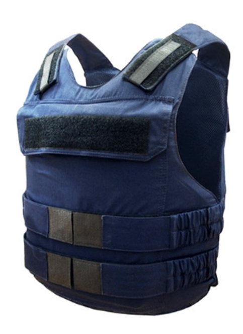
The tactical body armour is a special operations vest designed for tactical situations requiring lightweight ballistic protection.