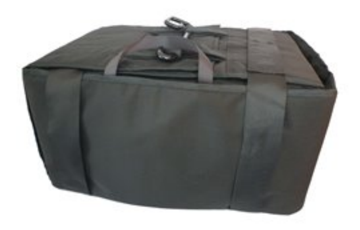
On board protection against electronic items