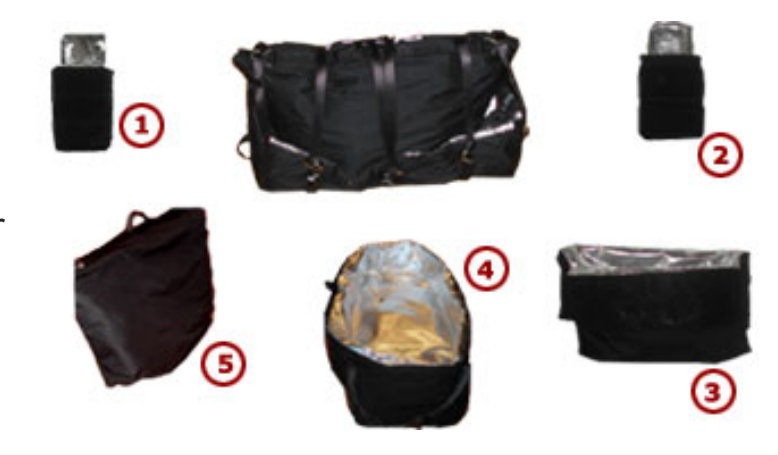
FBK is a new innovative and effective antibomb protection solution to the fight against terrorism